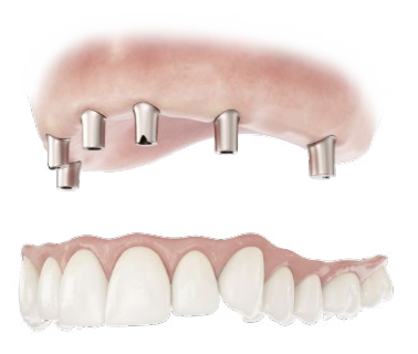
ATLANTIS™ Conus Abutment - custom

For removable overdentures designed to fit SynCone caps.