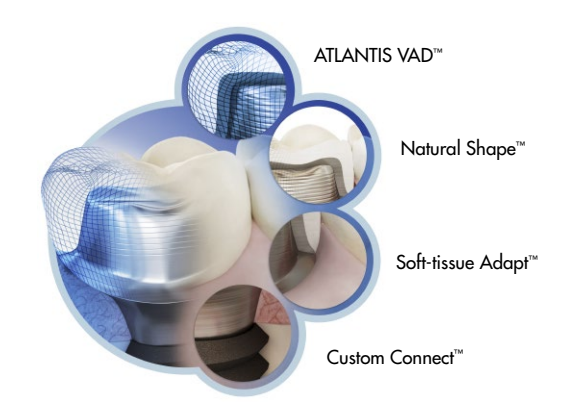
ATLANTIS BioDesign Matrix™

Strong and stable fit – customized connection for all major implant system. ATLANTIS abutment connections and screws are specifically engineered and tested for each implant interface for accurate fit, stability, and a successful result.