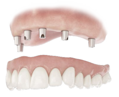
ATLANTIS™ Conus Abutment - overdenture

ATLANTIS Conus Abutment is a uniquely designed, conical shaped abutment that incorporates a friction fit, implant-borne prosthesis while being removable like an overdenture. It allows optimal access for oral hygiene while providing the patient with a cost-effective treatment option.